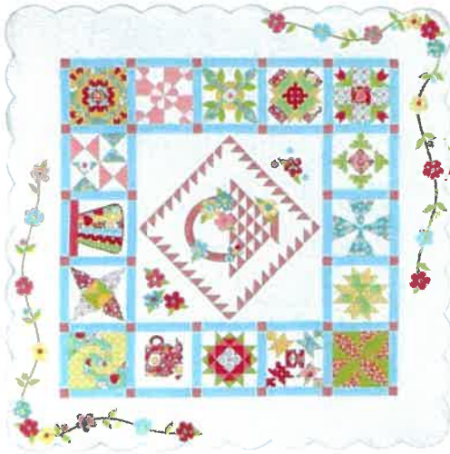
Sample from Quilts from El's Kitchen.

Ever set up your sewing machine on the dining room table? Who hasn't?