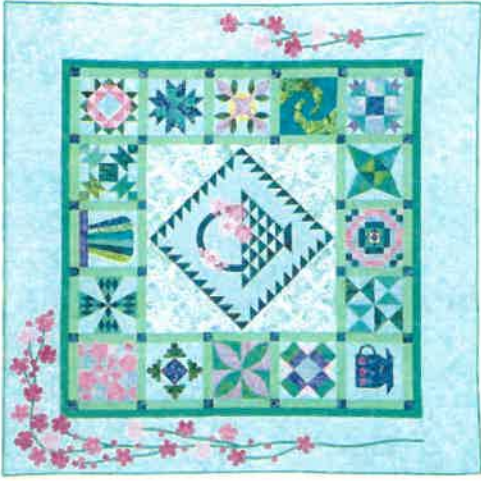
Sample from Quilts from El's Kitchen.