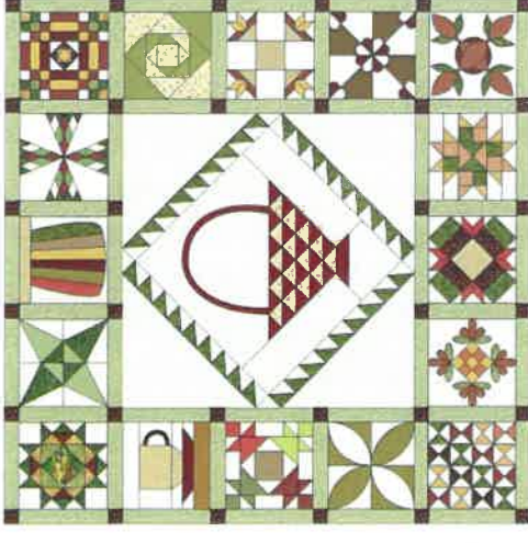
Another colorway without embellishment.